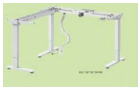
Everest Corner Workstations