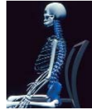
Healthy 'S' curve where head is properly balanced on top of the spine

Gregory uses scientific evaluation in the testing of its products. Thermographs show surface temperatures and indicate the difference in blood flow in the body after sitting over a period of time in a Gregory chair compared to an ordinary chair. Surface temperature is a function of the heat imparted by the body's circulation system. This means that warmer temperatures on the body's surface shows greater blood flow in the measured area. Small changes in surface temperature indicate larger changes in the deeper tissues. White areas show increased blood flow.