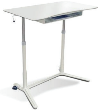
Jesper® Lift Table Sit Stand Desk

Jesper Office specializes in making modular office furniture for the home and small business, along with a complementary line of modular library and home entertainment furniture. The company, originally based in Denmark, has been designing and manufacturing high quality furniture since 1935.