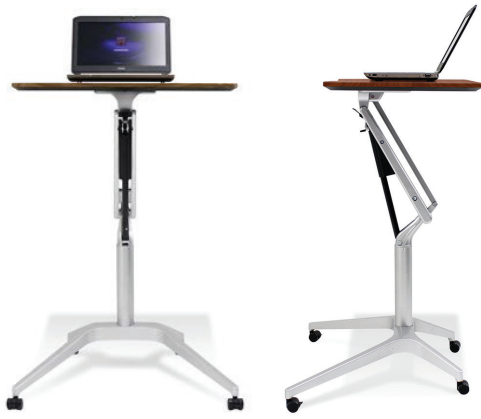
Jesper® Workpad Sit Stand Table