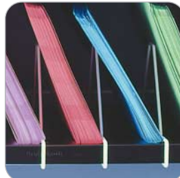
Shelf file rack divider