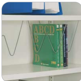
Sliding wire divider