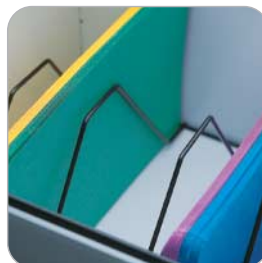
Drawer file rack divider