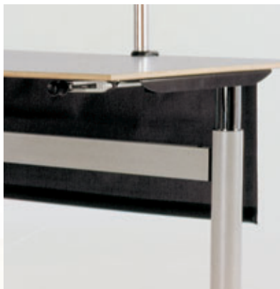
Mesh fabric modesty panel

The sleek design of ALTITUDE™ is complemented by items designed to provide personal comfort such as modesty panels and the handle resting bay. For manual operating desks, the handle is discreetly housed under the desk surface in an unobtrusive position allowing the user to access the height adjustment with ease.