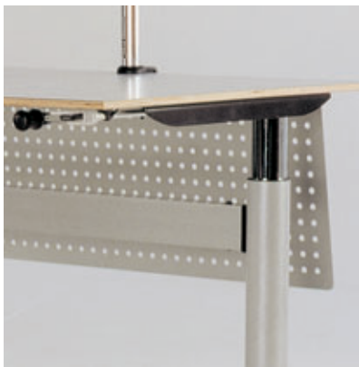
Perforated metal modesty panel