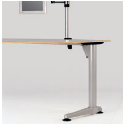
Fixed height leg