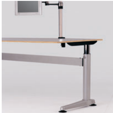
Incremental height leg