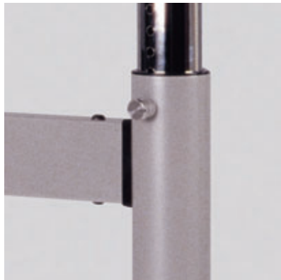
Pin and hole adjustment detail