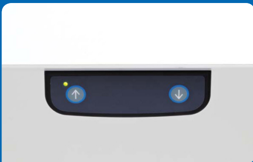
Sit 'N' Stand Electronically Operated Height Adjustable Desk Frame